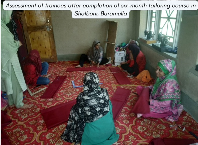
Assessment of trainees after completion of six-month tailoring course in Shalboni, Baramulla

CHINAR started second batch of Digital Learning Center at Palpora, Srinagar with an enrolment of 30 enthusiastic young boys and girls. The course is designed to equip them with basic computer skills including cloud storage and data management. Meanwhile, CHINAR is running another center in the same community where five youth are being honed in the art of carpentry. In Baramulla, nine women successfully graduated in a six-month cutting and tailoring course with the top performers receiving sewing machines to establish their own tailoring units.