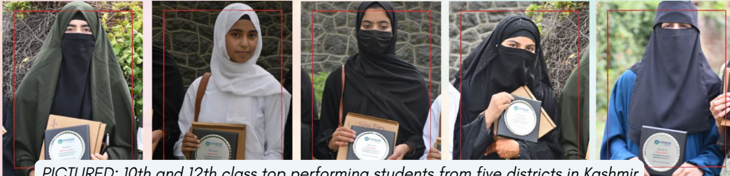
PICTURED: 10th and 12th class top performing students from five districts in Kashmir