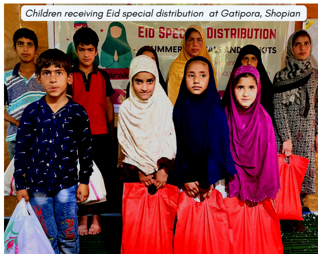
Children receiving Eid special distribution at Gatipora, Shopian

CHINAR conducted a special Eid distribution as part of the Child Development Program across six districts - Srinagar, Shopian, Pulwama, Budgam, Baramulla and Kupwara. Each kit included an assortment of snacks, cookies, juice cartons and essential items, along with casual clothes for children. The primary aim was to ensure that our beneficiaries wouldn't encounter any scarcity of supplies ahead of the auspicious occasion of Eid-ul-Azha and could celebrate the day joyfully together with their friends and relatives. Over 400 deserving families received these kits.