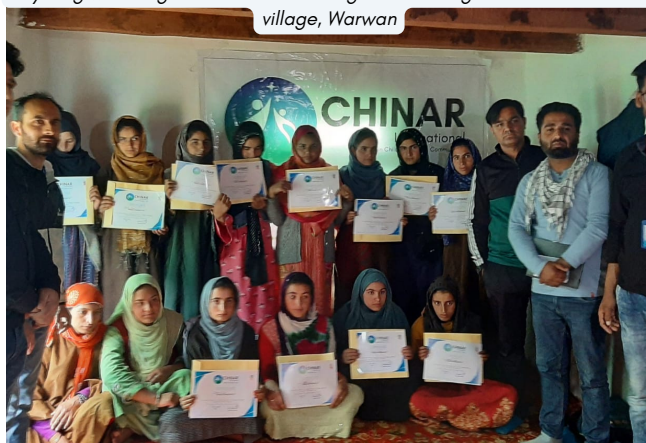
14 young women graduated from cutting and tailoring SDC in Choidraman village, Warwan