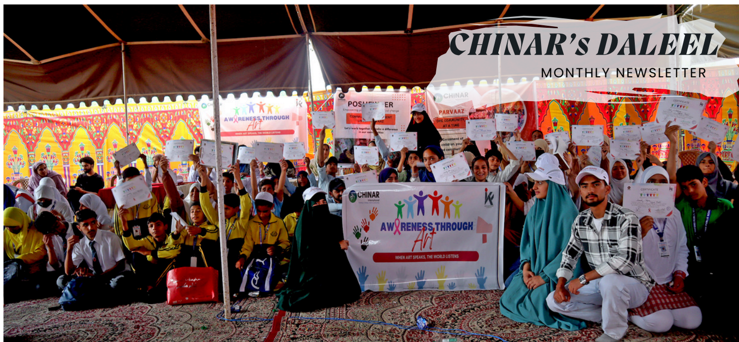
PICTURED: Poshewaer group members with participants of the "Awareness Through Art" event held at Palpora, Srinagar.