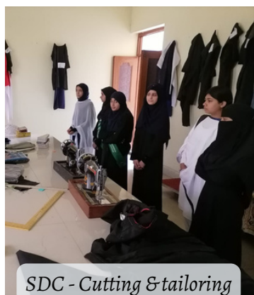
SDC - Cutting & tailoring

Three new Skill Development Centres (SDCs) were launched in May to equip youth with employable skills. A Sozni Arts SDC was set up in Ahmadpora (Baramulla), enrolling 18 trainees to preserve the traditional craft of Sozni embroidery. In Rakh Arath (Srinagar), the third batch of the Digital Learning Centre (DLC) was initiated with 18 trainees, focusing on enhancing digital literacy. Lastly, a Cutting and Tailoring SDC was established at Government Girls Higher Secondary School in Nowhatta (Srinagar), enrolling 19 trainees to promote self-reliance and entrepreneurship among young women. These initiatives reflect CHINAR's ongoing commitment to empowering youth through skill training and sustainable livelihood opportunities.