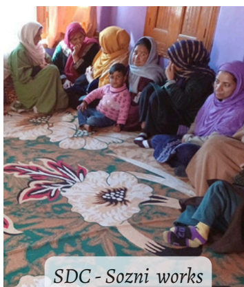
SDC - Sozni works