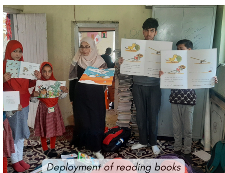
Deployment of reading books