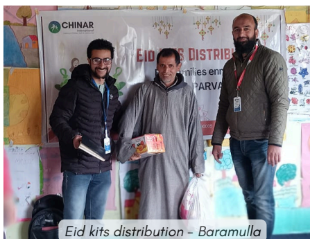
Eid kits distribution - Baramulla

Ahead of the auspicious occasion of Eid-ul-Fitr, CHINAR successfully distributed Eid kits to 496 families enrolled under Child Development across 7 districts: Shopian, Pulwama, Srinagar, Kupwara, Budgam, Anantnag and Ganderbal. These kits were meticulously composed to ensure that the families celebrate the occasion joyfully without facing any shortage of supplies.