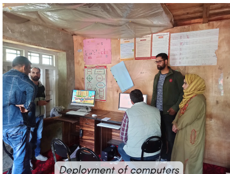
Deployment of computers

As part of Digital Literacy, 29 computers were allocated to 18 low-resource government schools, along with an additional 8 computers at CLCs. Access to computers will help in providing essential digital skills to vulnerable children which is much needed for success in today's digital age.