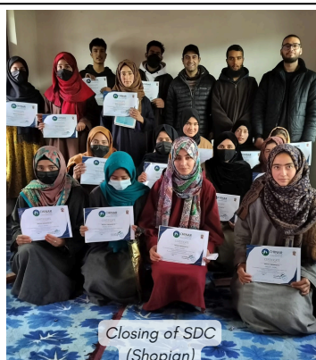
Closing of SDC (Shopian)