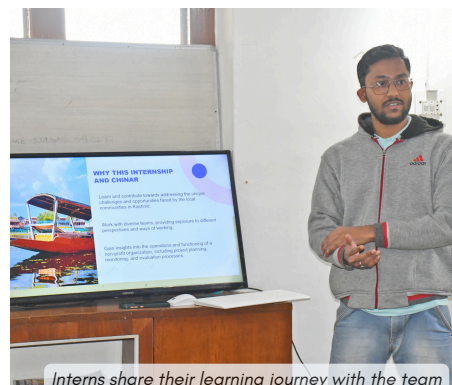
Interns share their learning journey with the team

"CHINAR runs a robust and comprehensive internship program attracting huge rush of interns from outside and abroad every year."