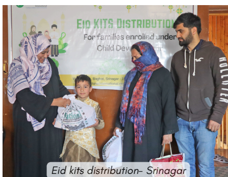
Eid kits distribution- Srinagar