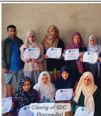
Closing of SDC (Baramulla)