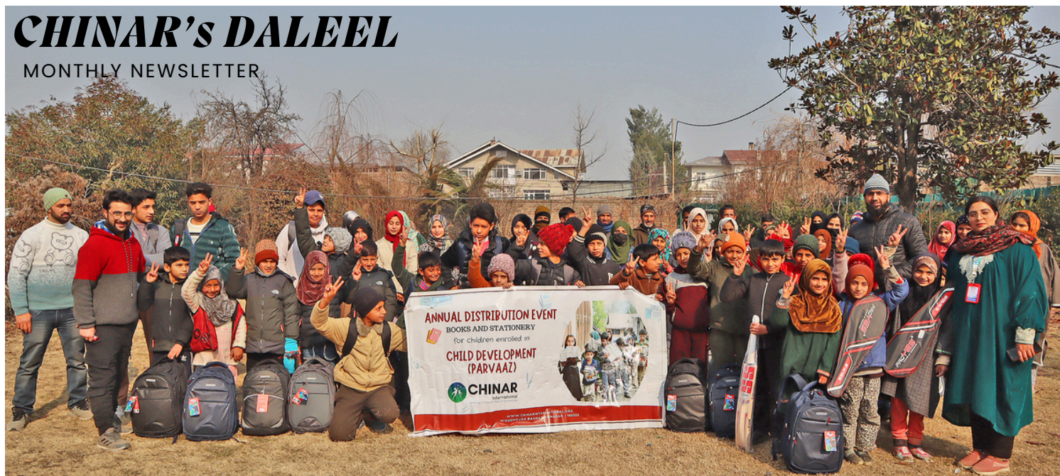
PICTURED: Enrolled children during stationery/sports kit distribution in Srinagar