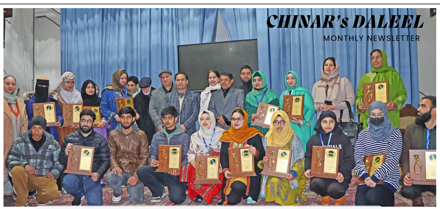
PICTURED: Student achievers and CHINAR fellows during felicitation at Multi-stakeholder conference held at Srinagar